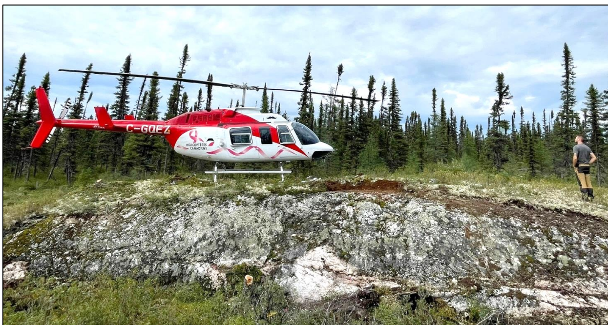
Figure 1: Photograph of the Polaris spodumene-bearing pegmatite outcrop on the CFE Project.