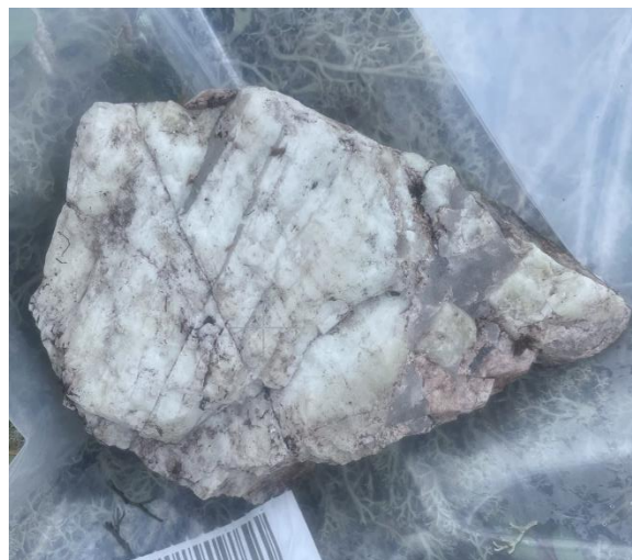
Figure 2 (top left): Photo of sample H909418 from Polaris. Photograph field of view contains 80% white to pinkish stained spodumene (SPD), 20% translucent quartz and feldspar. NB: UV light is 9cm for scale.